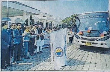
CM Conrad K Sangma flags off the Meghalaya health shuttle service in Shillong on Thursday

to provide pre-hospital transportation for patients and their attendants, ensuring better access to medical facilities.