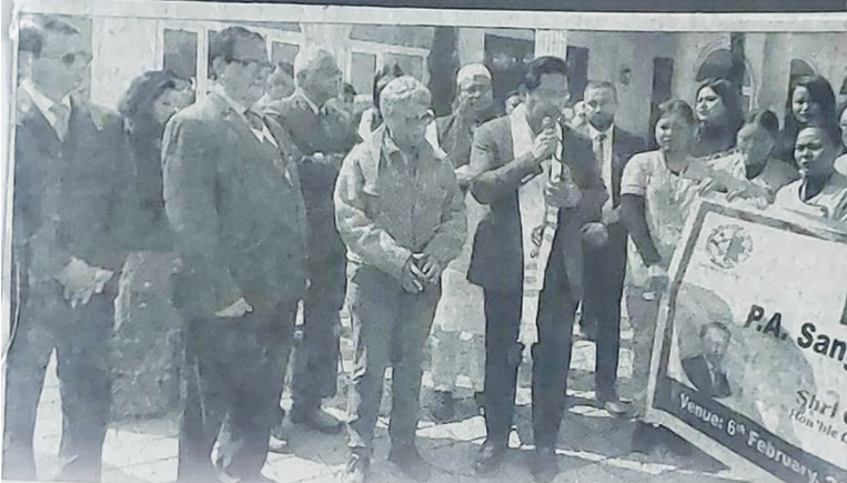
Meghalaya Chief Minister Conrad K. Sangma launching PIMC Health Shuttles

VOL XXXX NO. 289 Regd. No. 40782/83 GUWAHATI FRIDAY 7 FEBRUARY 2025 Rs 7.00