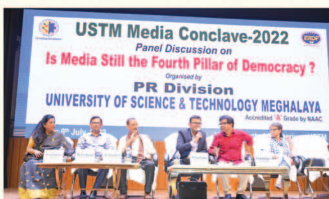
A view of the Panel Discussion on 'Is Media Still the Fourth Pillar of Democracy'