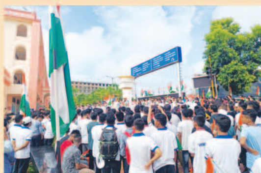
Azadi March at USTM on 14th August 2022

More than 2000 residential students of the USTM took part in the "Azadi March" organised on the occasion of Azadi Ka Amrit Mahotsav at the University campus on 14th August. A week-long programme commenced since 9th August at USTM for the celebration of Azadi Ka Amrit Mahotsav.