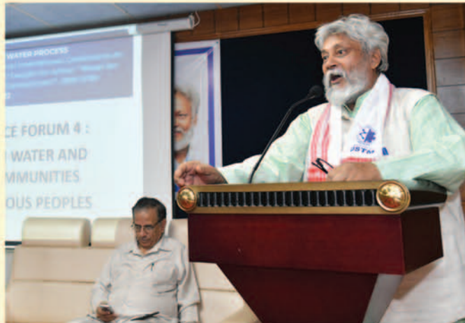
Waterman of India Dr Rajendra Singh speaking at USTM.