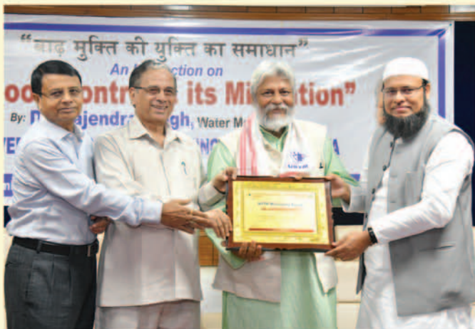
USTM Missionary Award being presented to Waterman of India Dr Rajendra Singh