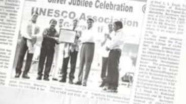
Silver Jubilee Celebration UNESCO Association