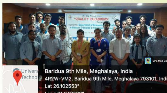
Baridua 9th Mile, Meghalaya, India 4R2W+VM2, Baridua 9th Mile, Meghalaya 793101, India Lat 26.102553° Long 91.846523°