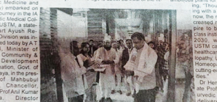
Students of the Ayurvedic Medical College, USTM, participating in the inauguration of the Ayush Research Division.