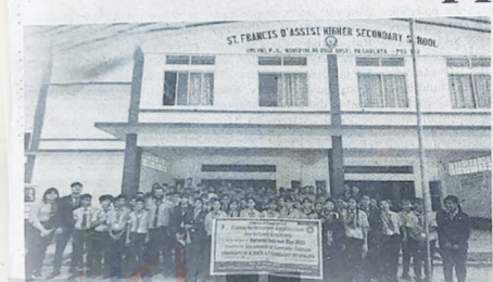
Students of St. Francis D'Assisi Senior Secondary School participating in an awareness program on the ethical use of internet applications.