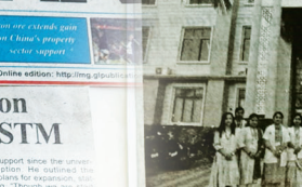
Students of the Ayurvedic Medical College, USTM, participating in the inauguration of the Ayush Research Division.