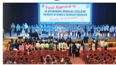
Final Approval to IA AYURVEDIC MEDICAL COLLEGE UNIVERSITY OF SCIENCE & TECHNOLOGY MEGHALAYA Thanks to Everyone

Assam Rising, Guwahati, November 1: The IA Ayurvedic Medical College (IAMC) at the University of Science and Technology Meghalaya (USTM) has received all the necessary approvals from the National Commission for Indian System of Medicine (NCISM) under the Union Ministry of Ayush.