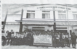
Students of St. Francis D'Assisi Senior Secondary School participating in an awareness program on the ethical use of internet applications.

The fashion contest was organised by Nya Tan Foundation Society of Itanagar.