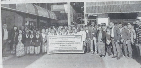
Students of Shillong College participating in the 2nd Meghalaya Chemistry Olympiad-2023.

ship program of the Chemistry department of USTM. Participants from other northeastern states will join the program subsequently. The Chemistry Olympiads provide an encouragement to begin a career in science, particularly in Chemistry, and undertake a lifelong journey into the realm of exciting intellectual challenges. The Olympiads are not merely a competition, but a meeting place for the brightest young minds of the state, and many friendships forged at the Olympiads form the seeds of scientific collaboration later in life. Like in the Olympics in sports, the Olympiads are a celebration of the very best in school-level science and chemistry.