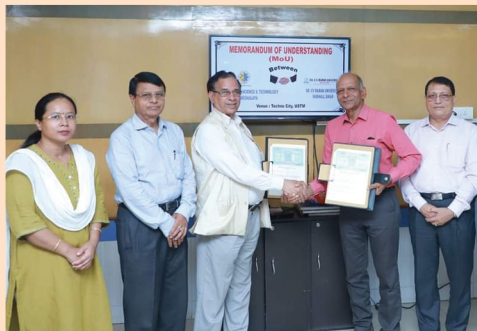
MoU with Dr. CV Raman University