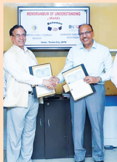
MoU with Ranbindranath Tagore University