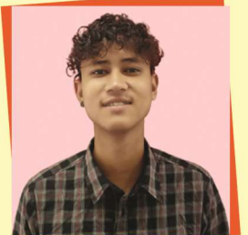
DAMEHI THMA B-Tech (CE) 2019-23 Batch

Students of RIST got their well-deserved placement at Star Cement.