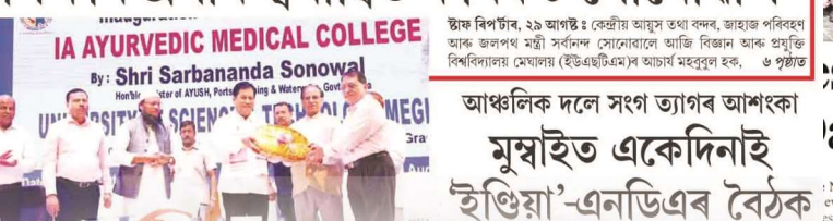
IA AYURVEDIC MEDICAL COLLEGE By: Shri Sarbananda Sonowal