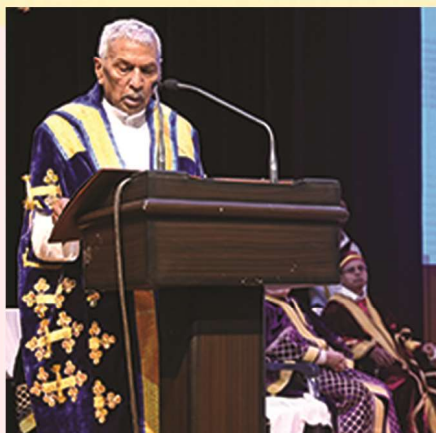
Shri Phagu Chauhan, Governor of Meghalaya