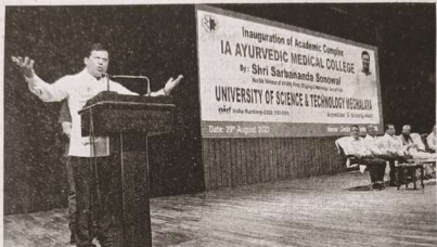
Union Minister of AYUSH Sarbananda Sonowal speaking during inauguration of an academic block at the USTM campus in Meghalaya on Tuesday.

GUWAHATI, Aug 29: Union Minister of AYUSH and Ports, Shipping and Waterways Sarbananda Sonowal today inaugurated the academic complex of the IA Ayurvedic Medical College (IAAMC) at the University of Science and Technology Meghalaya (USTM) in the presence of Mahabubul Hoque, USTM Chancellor, Prof GD Sharma, Vice Chancellor, USTM, and a host of dignitaries and thousands of students, a press release stated. The state-of-the-art new infrastructure houses an advanced research centre, a central instrumentation facility and different departments of the college.