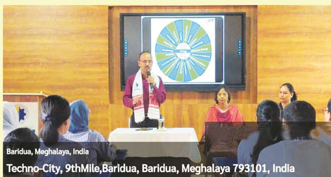
Baridua, Meghalaya, India