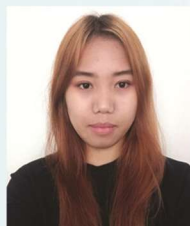
T Grace Puro Dept. of Sociology (UGC NET)