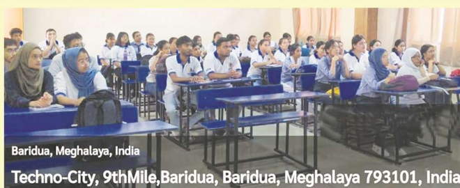
Baridua, Meghalaya, India