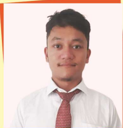
SUPERSTRONG ARM SHYLLA B-Tech (CE) 2017-21 Batch