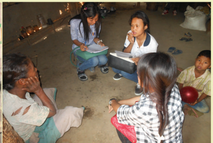
Department of MPA on field visit at Umnowe Village at Kling Road, Ri-Bhoi, Meghalaya