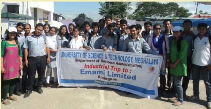
The students of MBA on a Industrial trip with their respective teachers.