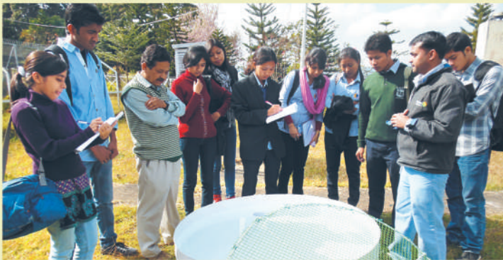
The students of the Department of the Environment Science on a educational trip with their respective teachers.