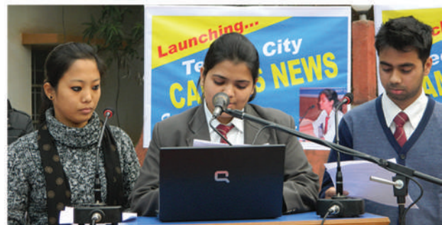
The first Techno City Campus News are delivering by the students