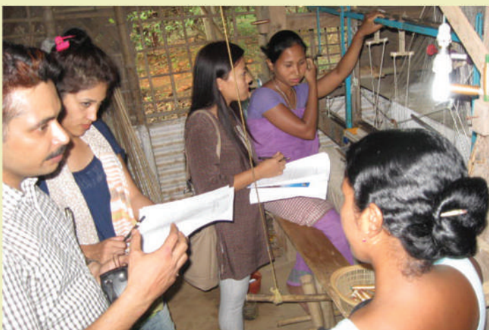
Department of MRD on field visit at JORBIL Village at Kling Road, Ri-Bhoi, Meghalaya