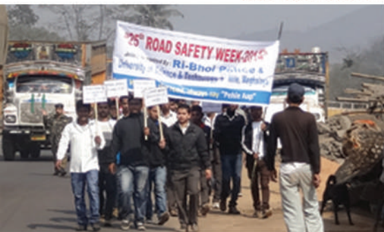
The students are at Road Safety Rally

Coinciding with the 25th Road Safety Week observed across the country, the students of Regional Institute of Science and Technology (RIST) and the University of Science and Technology, Meghalaya (USTM), took out a road safety awareness rally on 9th January, 2014, in association with Meghalaya Police of Ri-Bhoi district to spread the awareness among the public on road safety keeping in view the accident prone nature of the road stretch in question.