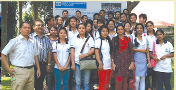
Students of Social Work & Sociology department visiting SOS Village, Azara, Guwahati for their field work along with Faculty members