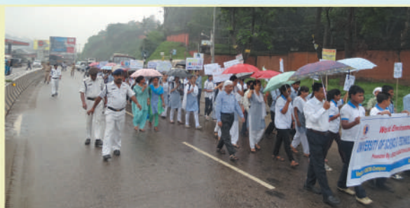
The students in the rally on Environment Awareness

A tree plantation program was also held in USTM campus in which invited guests, faculty and students of the University had participated.