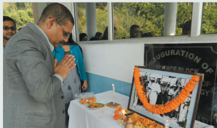
Faculties are paying tribute to Netaji