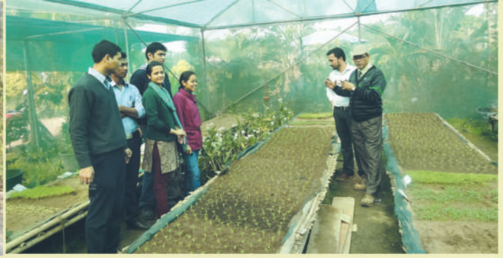
The students of the Department of Botany on an field visit to botanical gardens at Sonapur with their respective faculties.