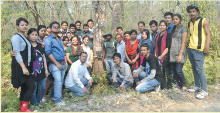
The students of the Department of Zoology on a field visit with their respective faculties at Manas National Park