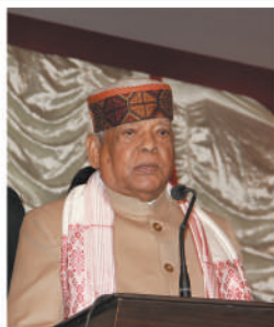
His Excellency Shri. J.B. Patnaik Governor of Assam