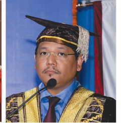
Shri Conrad K. Sangma CM, Meghalaya