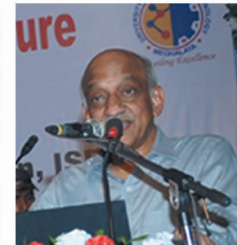
Shri A. S. Kiran Kumar Chairman, ISRO