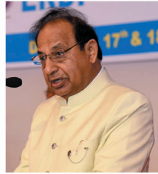
Shri Jagdish Mukhi Governor of Assam