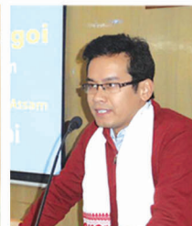
Shri Gaurav Gogoi Member of Parliament