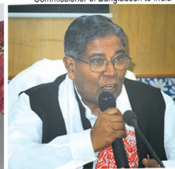
Mr. K. Rahman Khan Former Union Minister of Minority Affairs, Govt. of India