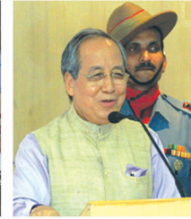
Shri R.S. Mooshahary Former Governor of Meghalaya