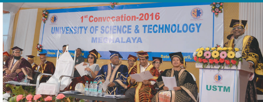
Hon'ble Governor of Meghalaya delivering the Convocation Address