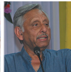
Shri Mani Shankar Aiyar Hon'ble Former Member Rajya Sabha