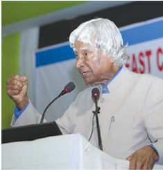
Late Dr. A.P.J. Abdul Kalam 11 th President of India