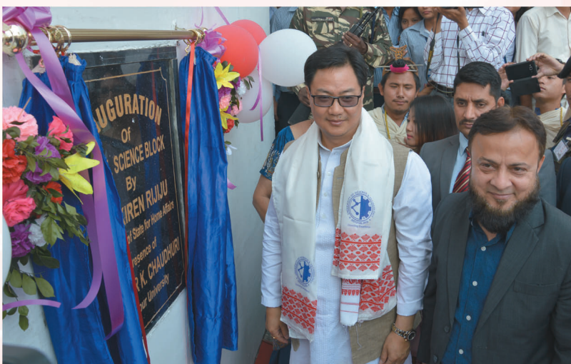
Shri Kiren Rijiju, Union Minister of state for Home Affairs inaugurated Social Science Block