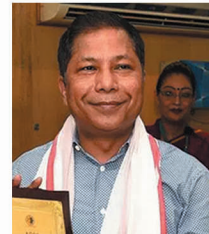
Dr. Mukul Sangma Former CM, Meghalaya