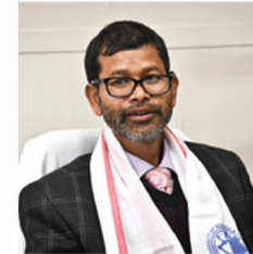
Shri Lakhmen Rymbui Hon'ble Minister of Education & Forenst, Meghalaya