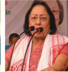
Dr. Najma Heptulla Governor of Manipur