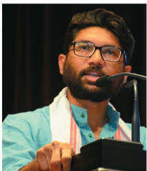
Jignesh Mevani Politician & Social Activist