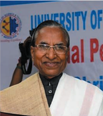
Sri Ganga Prasad Former Governor of Meghalaya