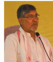
Shri Kailash Satyarthi Nobel Peace Laureate