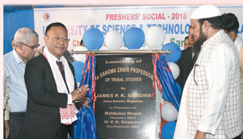
Meghalaya Home Minister James Sangma launching the PA Sangma Chair Professor of Tribal Studies