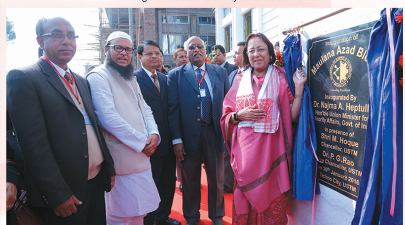
Dr. Najma Heptulla, Union Minister inaugurated the Maulana Azad Academic Block