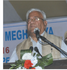
Shri P.B. Acharya Governor of Nagaland