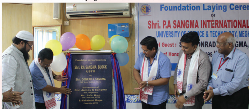
Shri Conrad K. Sangma, Hon'ble Chief Minister of Meghalaya at Foundation Laying of PA Sangma Block