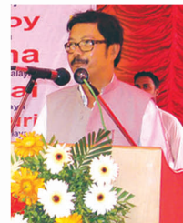
Dr. Donkumar Roy Former CM, Meghalaya