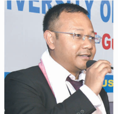
Shri James Sangma Home Minister, Meghalaya