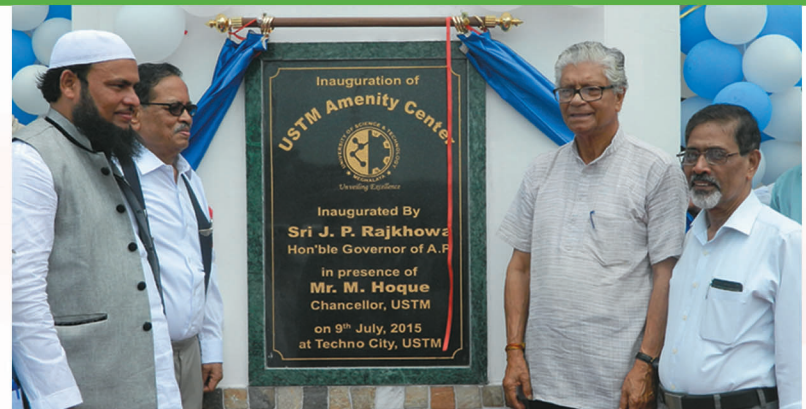
Shri Jyoti Prasad Rajkhowa, Hon'ble Governor of Arunachal Pradesh inaugurated the Amenity Centre at USTM