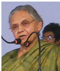
Smt. Sheila Dikshit Former CM, Delhi