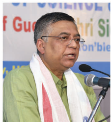
Shri Siddhartha Bhattacharya Hon'ble Education Minister of Assam