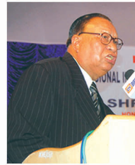
Dr. D.D. Lapang Former CM, Meghalaya