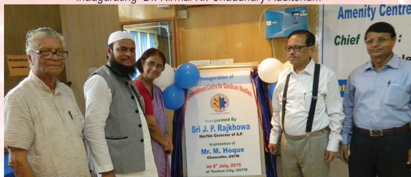
Shri Jyoti Prasad Rajkhowa, Former Governor of Arunachal Pradesh inaugurating the "International Centre for Gandhian Studies" (ICGS)