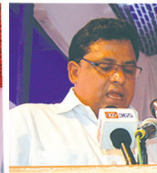
Shri A.T. Mondal, Speaker Meghalaya Legislative Assembly