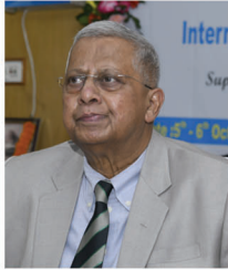
Shri Tathagata Roy Hon'ble Governor of Meghalaya