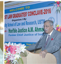
Justice A. M. Ahmadi Former Chief Justice of India