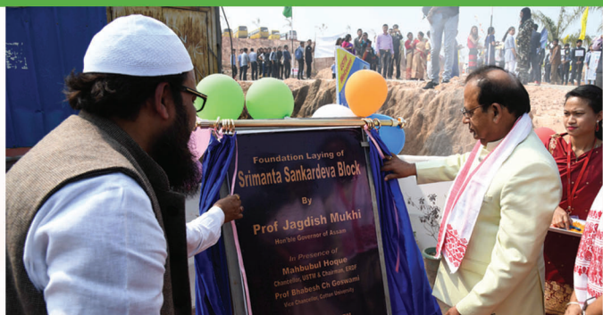
Prof. Jagdish Mukhi, Hon'ble Governor of Assam at the Foundation Laying of Srimanta Sankardeva Block