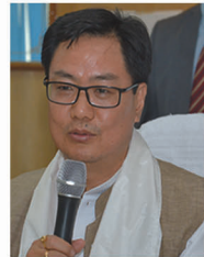
Shri Kiren Rijiju Union Minister of state for Home Affairs