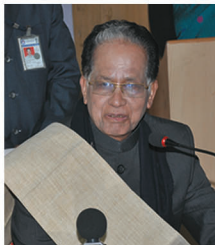
Shri Tarun Gogoi Former CM, Assam