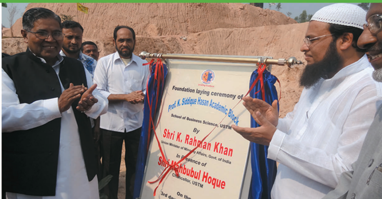
"Academic Block" Foundation Laying by Shri. K. Rahman Khan, Former Union Minister of Minority Affairs