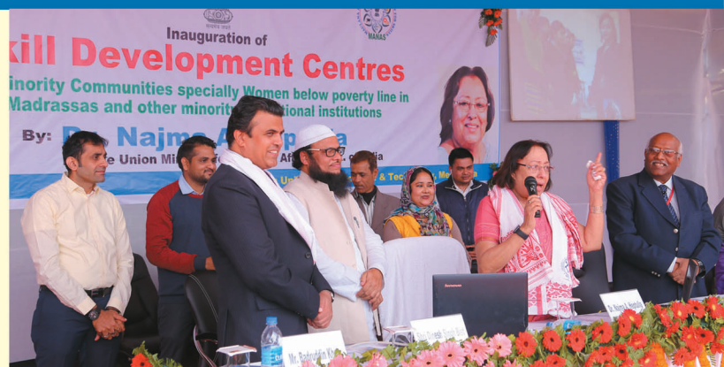
Dr. Najma Heptulla, Governor of Manipur & former Union Minister inaugurated the Skill Development Centres at USTM

USTM established a specialized Centre for Skill Development at the campus with the aim to empowering young people through improved skills, knowledge and internationally recognized qualifications to enable them access to decent employment and to promote inclusive national growth. Skills and knowledge are the driving forces of economic growth and social development of any country. A number of programs were already held under this skill development centre at USTM. A Skill Development Centre for Jail inmates on October 22, 2016 at the Central Jail, Guwahati was launched under the CSD. This training centre is an idea with the aim to re-establish the concept that the jail should ideally be the place for reform. Apart from this a “Centre for Foreign Language Training” has also introduced under the CSD where the students of USTM are availing the French language coaching classes. USTM has planned to introduce some more foreign language training classes in coming future.