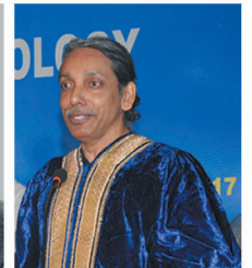
Prof. M Jagadesh Kumar VC, JNU