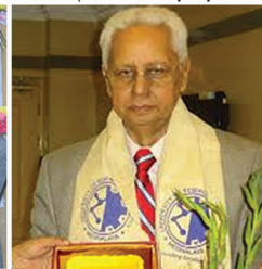
His Excellency Syed Muazzem Ali, High Commissioner of Bangladesh to India