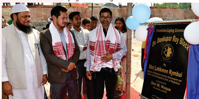
Shri Lakhmen Rymbui, Hon'ble Minister of Education, Forest etc. Meghalaya at Foundation Laying of Dr. Donkpur Roy Block